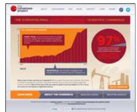
The Consensus Project Website